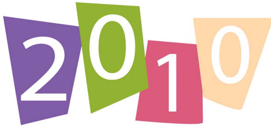
Exhibit & Sponsor Opportunities